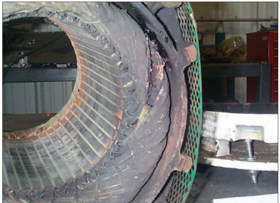
Rust from moisture contamination