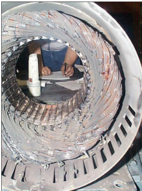
Generally discolored winding of an overloaded motor.

(copper oxides) on the winding. A low megger reading can also indicate water contamination.